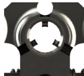
Detail View of Bores