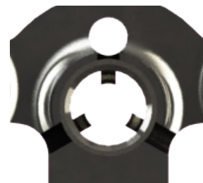
Detail View of Bores